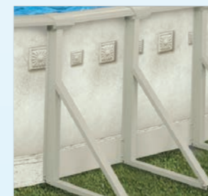
Heavy-duty angle brace system