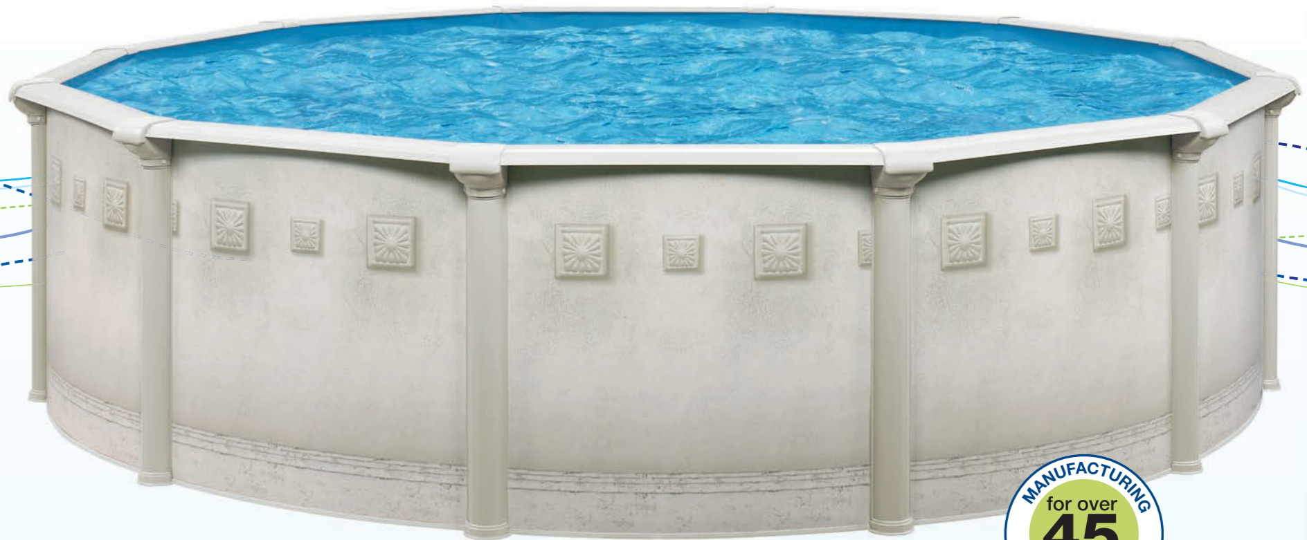
Round Millenium - Tuscan wall offered in 52 and 54 inches

If you're handy with a screwdriver, then you can easily assemble your MILLENIUM CORNELIUS pool. We've designed each pool to make installation problem-free—no multi-sized washers or nuts to worry about. Just one large screw type is used to assemble the entire pool and we provide easy-to-follow instructions.