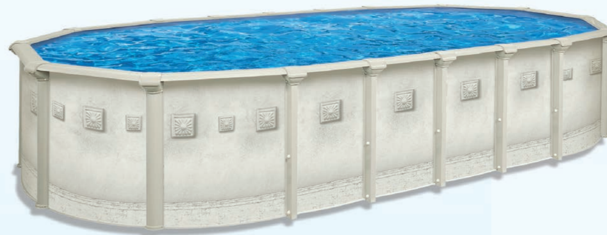
NBS oval Millenium - Tuscan wall offered in 52 and 54 inches