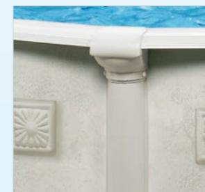
Ledge, cap and post designed for a secure fit