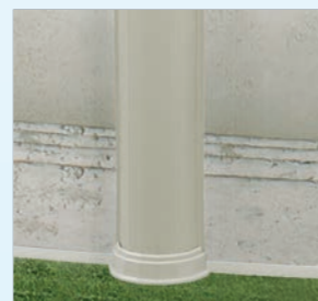
One-piece resin foot collar