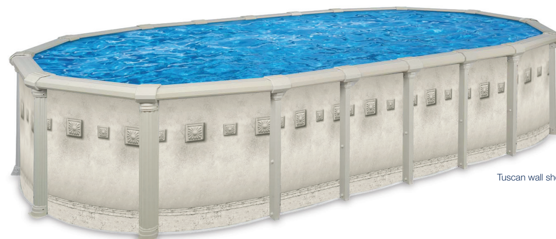
Tuscan wall shown