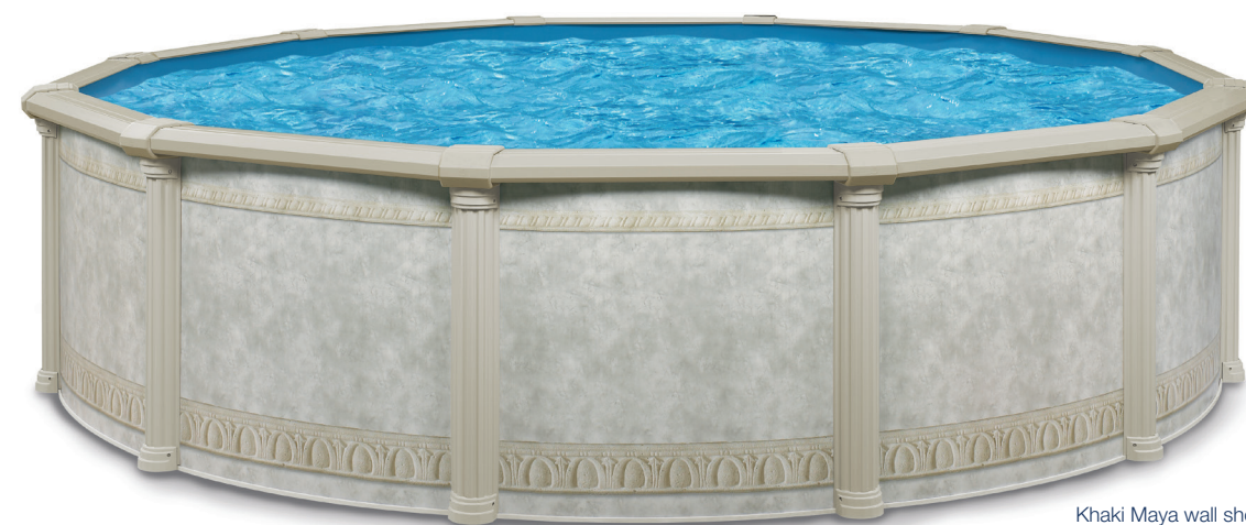
Khaki Maya wall shown